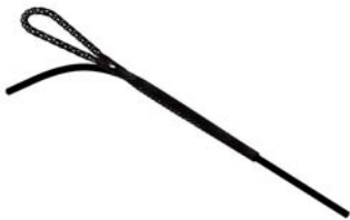
Image shows grip installed on cable.

For diameters not listed and for use on jacketed cable, synthetic cables and diameters not listed, contact PMI.