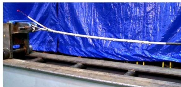
PMI CABLE-GRIP™ Termination shown applied on cable under tension.