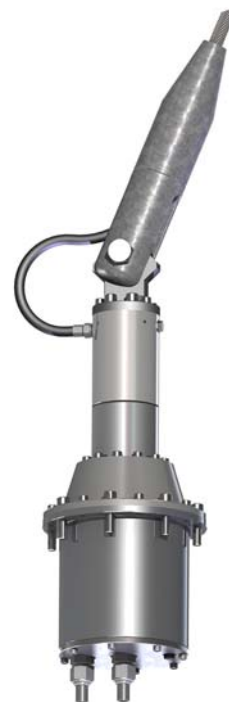
ROV E-O-M Swivel