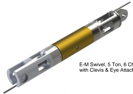
E-M Swivel, 5 Ton, 6 Channel with Clevis & Eye Attachments