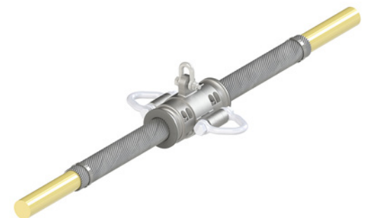
Umbilical DYNA II